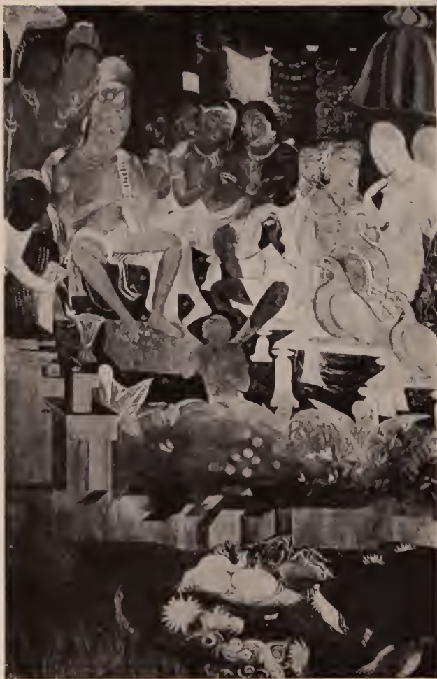
FRESCO IN CAVE 17, AJANTA, ILLUSTRATING THE MAHA HAMSA JATAKA (SIXTH CENTURY), FROM "AJANTA FRESCOS," INDIA SOCIETY.